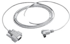
07 SK 50