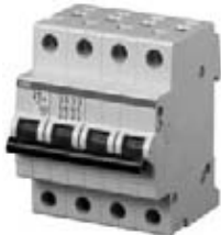
S204-B, 4 pole S203-BNA, 3P+N