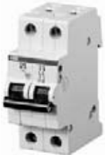
S202-B, 2 pole S201-BNA, 1 P+N