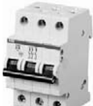
S203-B, 3 pole