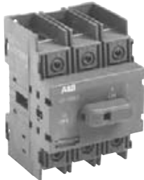
OT30E3 OT60E3 OT100E3