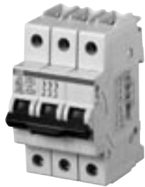
S203U-Z, 3 pole