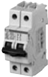
S202U-Z, 2 pole