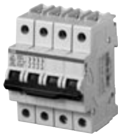
S204U-Z, 4 pole