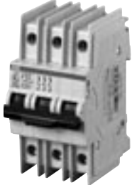
S203UP-K, 3 pole