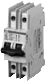
S202UP-K, 2 pole