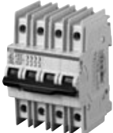
S204UP-K, 4 pole