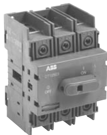
OT30E3 OT60E3 OT100E3