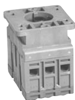
OT16ET3 OT25ET3 OT32ET3