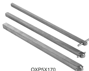
OXP5X170 OXP8X240 OXP12X325