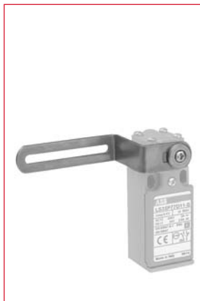
Lever adjusted to the left (by user)