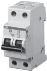
S202-C, 2 pole S201-CNA, 1P+N