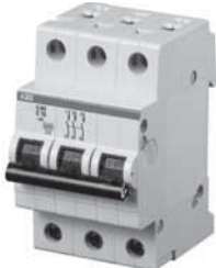
S203-C, 3 pole