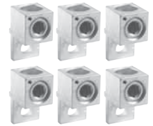
Lug kit (as required)